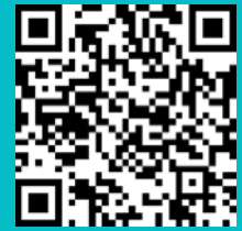
2015 CAREER FAIR VIDEO RECAP