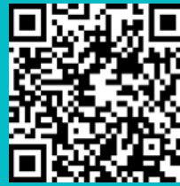
2018 CAREER FAIR VIDEO RECAP